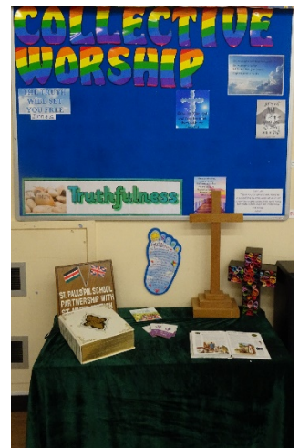
Focal area in the School Hall