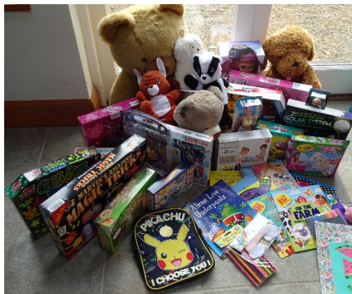
Barnardo's Toy Appeal

ADD club was created in 2012 and has been continuously evolving since thanks to the caring children we have in our school.