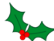
Table of The Week

We would like to wish everyone a merry and peaceful Christmas.