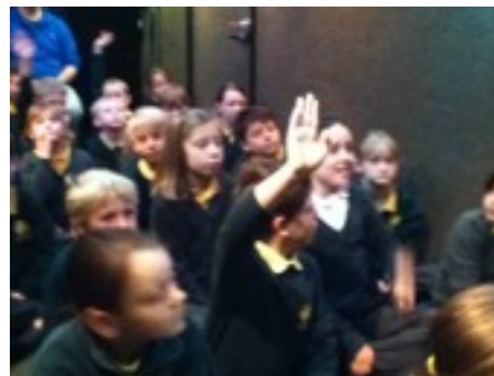
On board the bus!