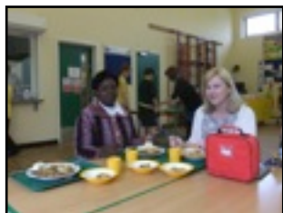
Eating her school lunch