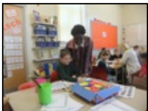
Meeting the pupils

Here are some photos of her exploits so far!