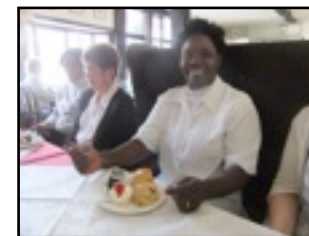
Eating her first cream tea!