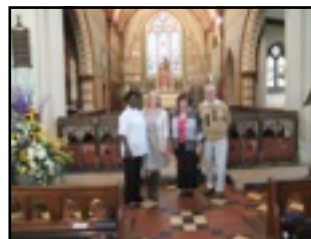
Visiting the Church